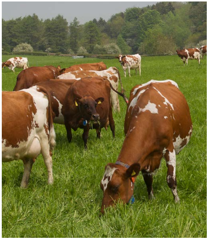
Figure 3. Cows at grass