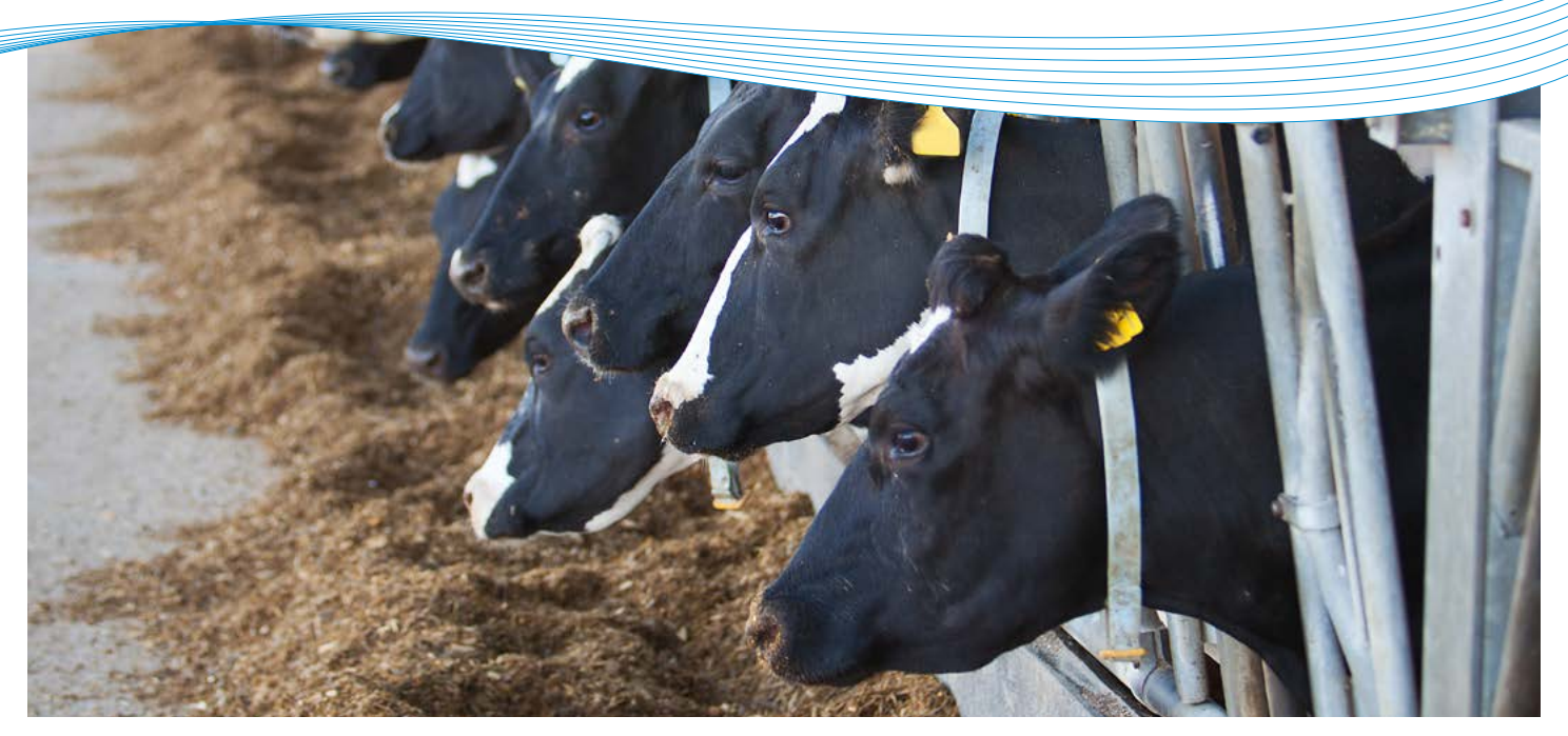
Figure 1. Cows feeding